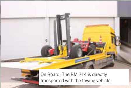
On Board: The BM 214 is directly transported with the towing vehicle.

The fork carriage is provided with a removable device. Therefore the truck mounted forklift BM can be used at any time as a forklift. For the safety of employees as well as for protection of vehicles and for convenient handling, the BM is equipped with a large lamp and various special mounting brackets. These modifications have been approved for the newest application areas of the truck mounted forklift (TMF) BM (TÜV Inspection Netherlands).