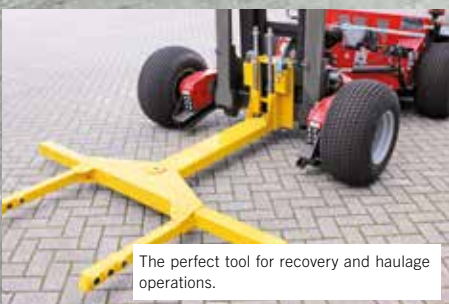
The perfect tool for recovery and haulage operations.