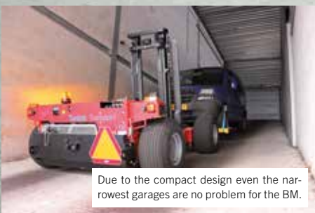
Due to the compact design even the narrowest garages are no problem for the BM.